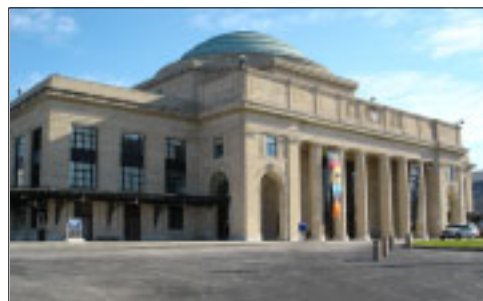
The Camera Club of Richmond meets at the Science Museum of Virginia, 2500 W. Broad Street, Richmond.

The Camera Club of Richmond invites prospective members to attend our meetings which are held the second Wednesday of each month at 7:30 p.m. at the Science Museum of Virginia.