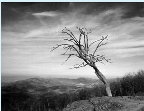
Bald Face Mountain Overlook